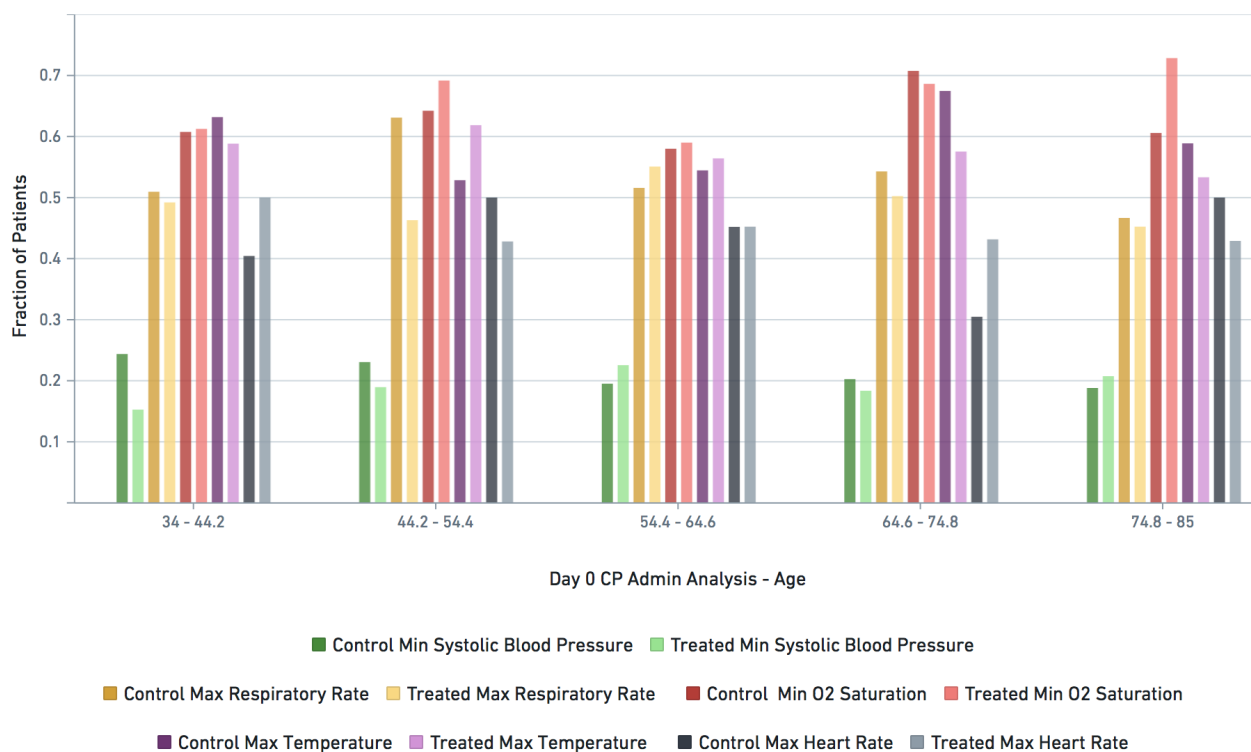
Figure 2: Patient state indicator distribution across age groups (as fraction of age group) for treated (with CP on Day 0) and matched control cohorts used for statistically significant clinical effect analysis. The darker shade of each colored pair is Control (untreated), while the lighter shade is Treated (with CP). For example, the dark purple (control cohort) and light purple (treated cohort) bars on each age group represent max temperature (normalized between 0 and 1).