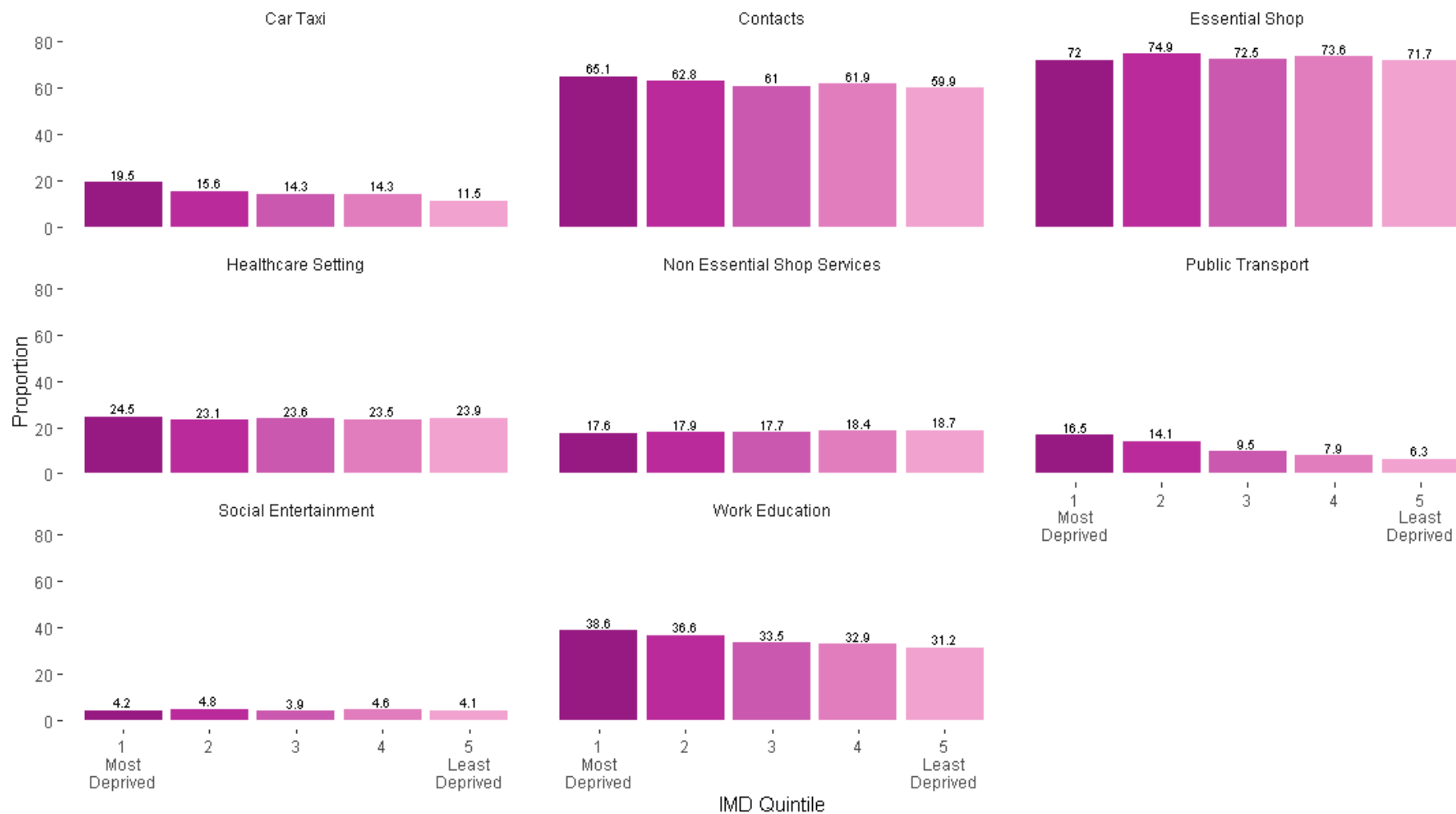
Figure 1. Proportion of Participants Reporting Public Activities and Non-Household Contacts by IMD Quintile (24 Nov 20 – 01 Dec 20)