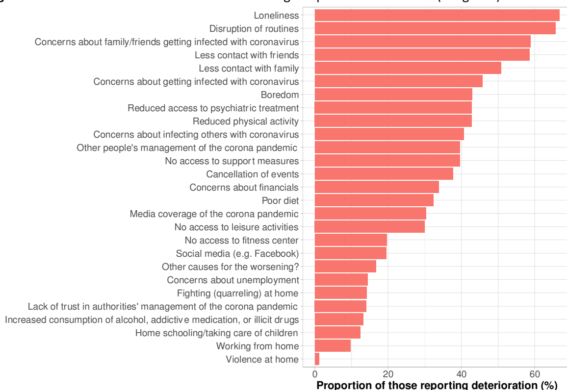
Figure 3: Perceived reasons for deterioration during the pandemic lockdown (weighted).

Perceived reasons for deterioration among the 479/925 (52%) of the respondents who reported that their overall mental health had worsened during the nationwide pandemic lockdown stratified on the following diagnostic groups: psychotic disorder (ICD-10: F2x), bipolar disorder (ICD-10: F30-31), unipolar depression (ICD-10: F32-33), anxiety disorder (ICD-10: F4x), and personality disorder (ICD-10: F6x) are available in Supplementary Figure 2 and Supplementary Table 2.