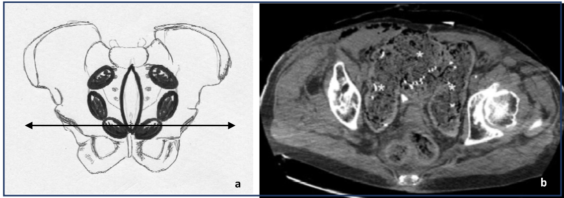
Diagram showing the disposition of the incision and pads (a) and corresponding pelvic-CTscan slice (b) performed after preperitoneal pelvic packing : The laparotomy gauze (*) fill the lateral rectal fossae, the space of Retzius and the retro-inguinal space of Bogros, compressing the venous plexuses against the bony pelvis.