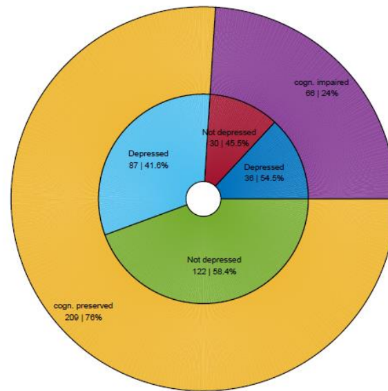
Figure 2: Composite measure of impairment in the total population.