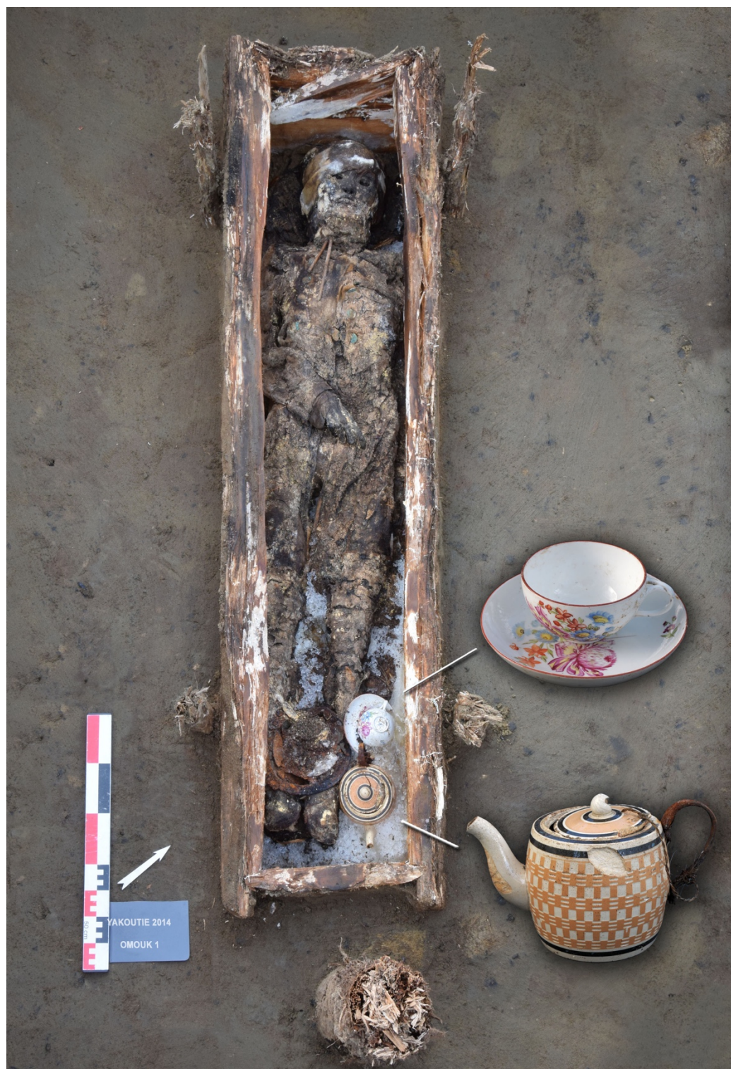
Figure 1. Omouk 1 grave with artefacts: teapot and cup, and under the legs and feet the smoking kit (iron lighter, fire bag, pipe).

This grave (around 1820) was found on the Indigirka River, Arctic Circle. The cup originated from the Russian factory A. Popo known for its solid porcelain. The teapot is of English origin. The woman's hair had high levels of nicotine, cotinine, and the highest concentration of caffeine, theobromine and theophylline.