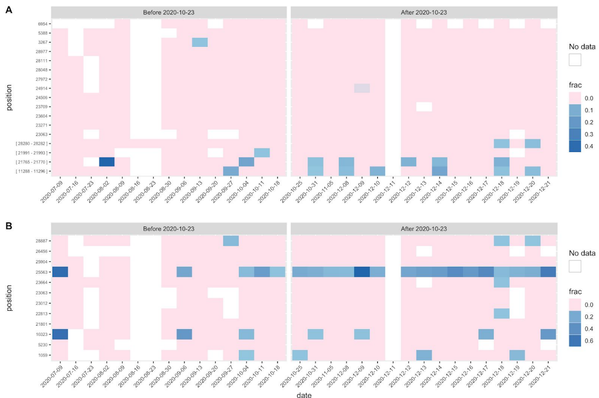
Figure 1. Occurrence of B.1.1.7 (A) and 501.V2 (B) signature mutations in wastewater samples collected in Zurich over time. Blue color shading encodes the estimated frequency of mutations detected in the sample, pink indicates absence of the mutation, and white indicates missing values (due to lack of sufficient coverage).

time and number of signature mutations was assessed by comparing the number of times we found evidence for and against signature mutations between the early and the late group excluding missing data due to low coverage, and did not reach statistical significance ( p = 0.093 , Fisher's exact test). For the 12 501.V2 signature mutations, we find six occurring 37 times in total (in 21, 7, 4, 2, 1, and 1 samples), 10 before and 27 after October 23, and a significant association of their occurrence before versus after October 23 ( p = 0.036 ). The most prevalent mutation found in every sample after October 23 is the Orf3a mutation G25563T, which is highly prevalent in the Swiss population at 22.6 % according to GISAID (Table 1). Stratification of the GISAID data by sampling time, shows that the prevalence of this mutation increased from 12.6% before October 23 to 34.6% after October 23 in the population, which matches the trend observed in the wastewater data. Hence, the increase in frequency in wastewater samples is likely not related to occurrence of the 501.V2 variant, because among patient samples, few other signature mutations were observed in combination with G25563T, most frequently the pair (C1059T, G25563T) in only 199 out of 5192 (3.8%) consensus sequences.