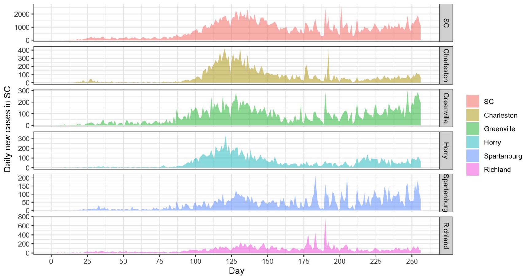
Figure 1. Daily COVID-19 new cases at both state- and county-levels in SC