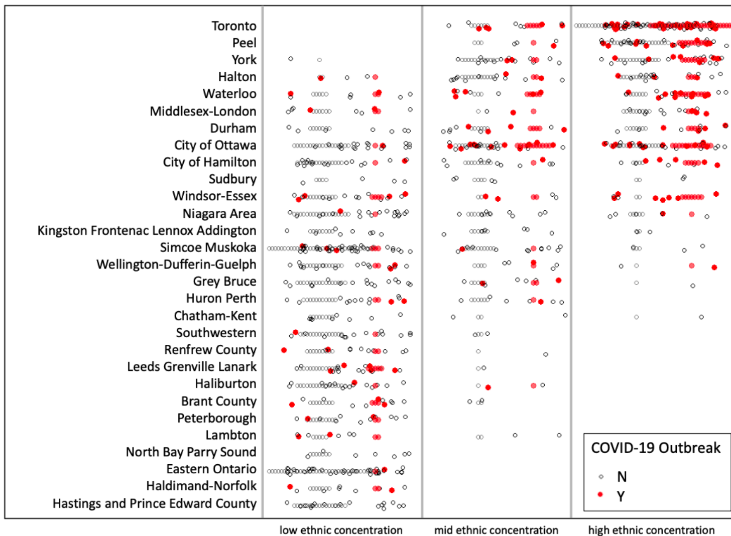
Figure 1. Retirement Home COVID-19 Outbreaks by Community-level Ethnic Concentration and Public Health Unit Region, Ontario, Mar 1-Sep. 24 2020. Public health unit regions with less than 5 retirement homes are excluded.