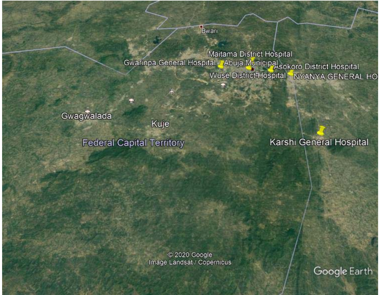
Fig.1: Geospatial Map of Public Secondary Health Facilities in AMAC