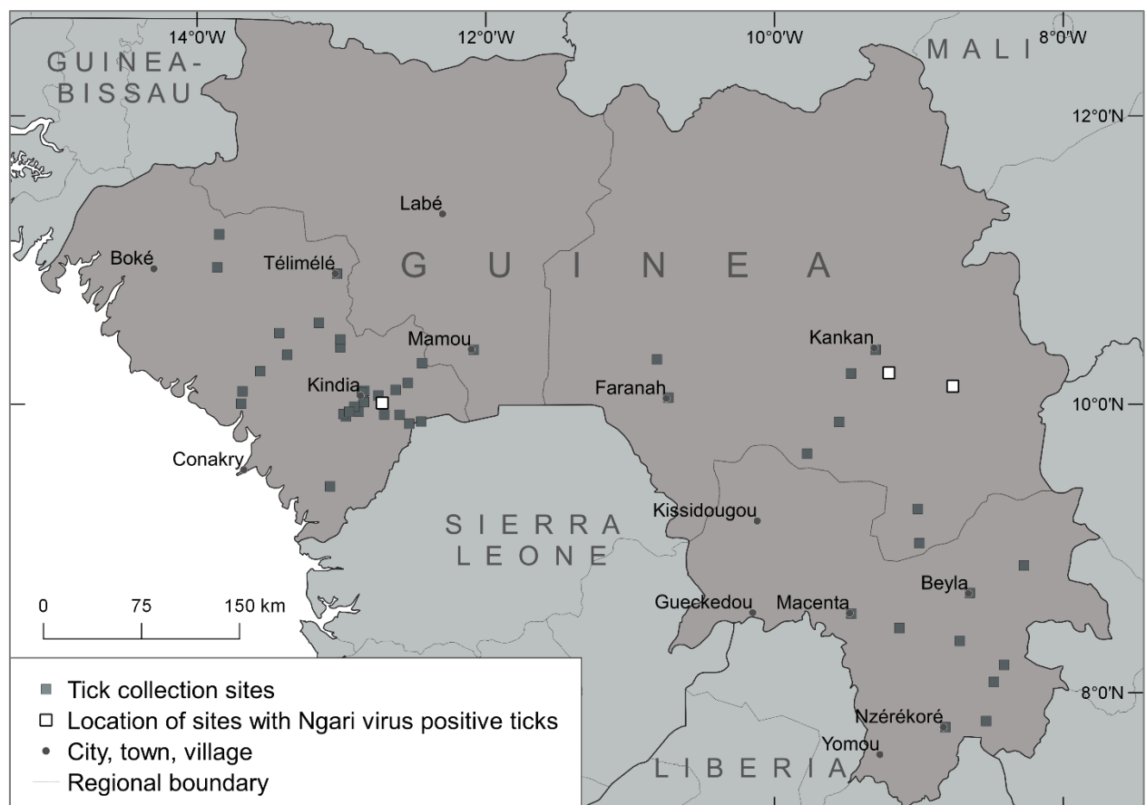
Fig.1 Map of collection sites with depicted locations of Ngari-positive tick detection

** – here “Ngari-positive cows” means cows from which the Ngari positive ticks were collected