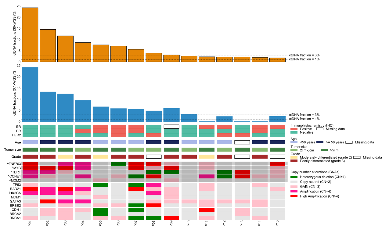
Figure 1. Co-mutation plot showing association between clinical information and genomic characteristics. Patients are represented by the columns ordered by decreasing ctDNA fraction. The top two rows show bar plots of tumor fractions estimated with ichorCNA from cfDNA sequenced with 30x WGS-cfDNA (gold bars) and 0.1x WGS-cfDNA (blue bars) ( n=15 patients). The horizontal line across the bar plot shows the limit of detection of ichorCNA for 0.1x (ctDNA fraction= 3%) and a threshold for 30x (ctDNA fraction=1%) for the detection of ctDNA. Immunohistochemical stains for ER, PR and HER2+, age and tumor size classification are presented. Copy number gain and loss of selected genes exhibiting a high frequency of deletion or amplification in breast cancers from TCGA 13 are shown in the bottom panel. Genes with the caret symbol (^) and shaded show copy number alterations that are significantly higher among breast cancers of African-Ancestry than in European-Ancestry patients 13 .

The 30x WGS-cfDNA analysis indicated that all 15 breast cancer patients had at least 1% of the total cfDNA corresponded to ctDNA (median [IQR] 3.96% [2.22%-8.13%]). The tumor fractions in TNBC samples were significantly higher than the other subtypes ( p=0.04 ; two-sided Wilcoxon rank sum test). A comparison of the estimated ctDNA fraction from the 30x cfDNA-WGS with the 0.1x WGS-cfDNA showed high concordance between estimated ctDNA fractions (Pearson r = 0.9 ). Using 0.1x WGS-cfDNA, a minimum of 1% ctDNA fraction was detected in 12 (80%) (95% CI 52%-96%, Figure 1).