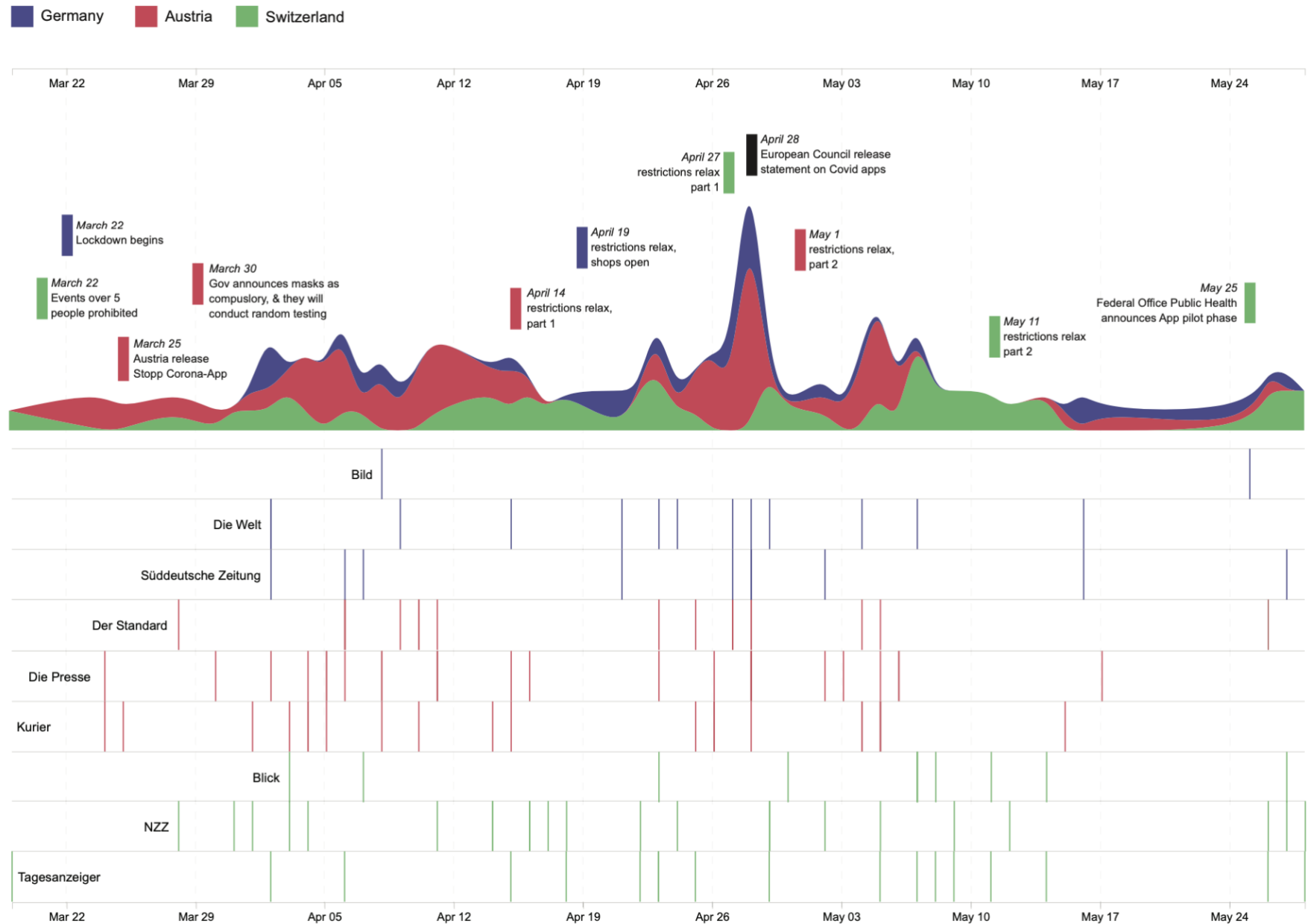
Fig. 1 Distribution of analyzed articles published between 201 March 19 and May 29, 2020