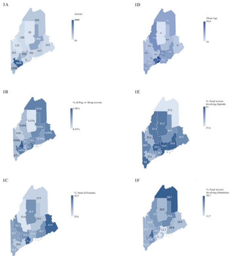
Figure 1. Maine Division Alert Program heat maps show total number of arrests for illicit and prescription drugs (A), percent of the population arrested for illicit pharmaceutical drug (B), percent of females arrested for illicit pharmaceutical drug use (C), mean age of females arrested for illicit pharmaceutical drug use (D), percent of total arrests involving illicit opioid use (E), and total arrests involving illicit stimulant use (F) corrected for population in 2015.