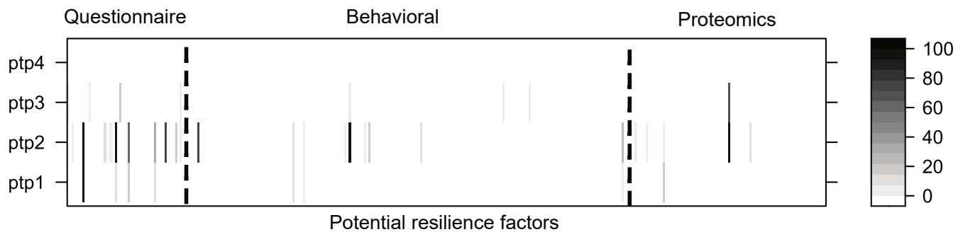
Figure 3. Inclusion frequencies of potential resilience factors in % (shades of gray) using a cross-validated lasso analysis ( n = 88 ; p = 350 ; 1000 repetitions) predicting mental health at predefined time points (ptp) of the artificial stress test, i.e., the intersection of the blue lines with the vertical, dotted lines in Figure 2). We identified potential resilience factors in all three data modalities (i.e., questionnaires, behavioral measures, and proteomics).