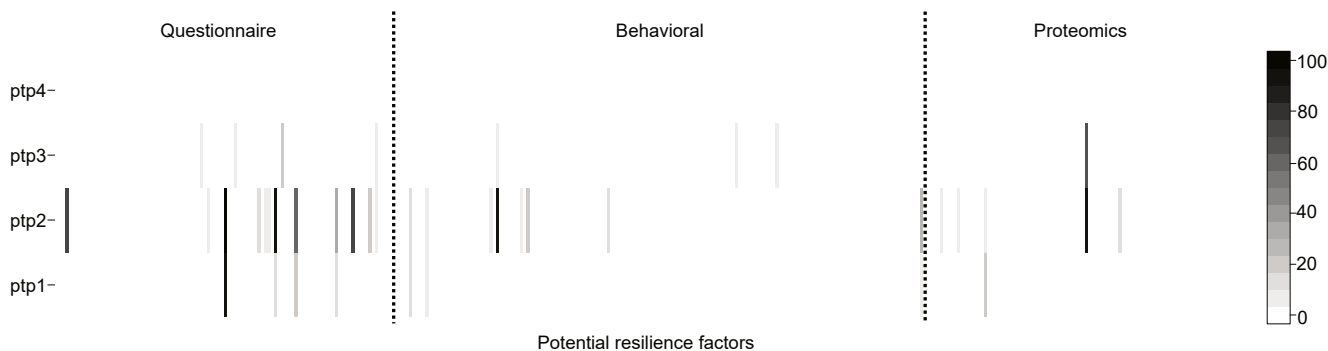
Figure 3. Inclusion frequencies of potential resilience factors in % (shades of gray) using a cross-validated lasso analysis ( n = 155 ; p = 350 ; 1000 repetitions) predicting mental health at predefined time points (ptp) of the artificial stress test, i.e., the intersection of the blue lines with the vertical, dotted lines in Figure 2). We identified potential resilience factors in all three data modalities (i.e., questionnaires, behavioral measures, and proteomics).

of mental health ( \eta_{i,1} ) and reactivity of mental health to stressors ( \eta_{i,2} ) independently. In contrast, the artificial stress test considers all parameters jointly, to obtain a holistic picture of resilience. This also serves as a diagnostic tool to investigate whether the training of the algorithm succeeded. We choose four points in time (after 5, 9, 15, and 20 months) and predict the individual mental health values with measurements from the baseline battery, covering proteomics, behavioral measures, and questionnaires.