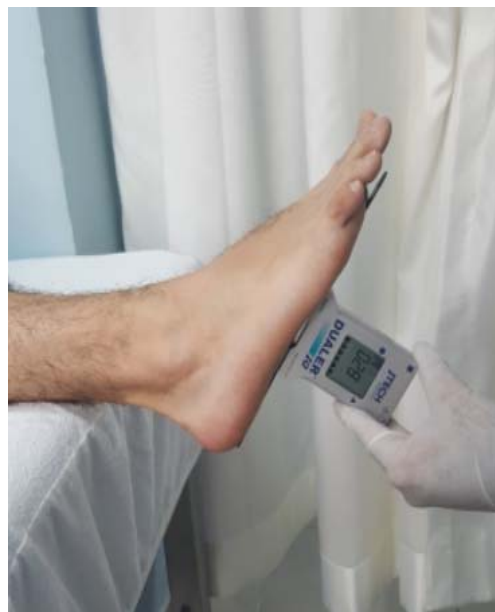
Figure 2: Plantarflexion range of motion assesment with inclinometer