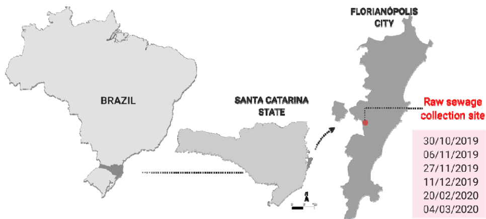
Figure 1: Maps of the sampling location in Florianópolis city, Santa Catarina State, Brazil.