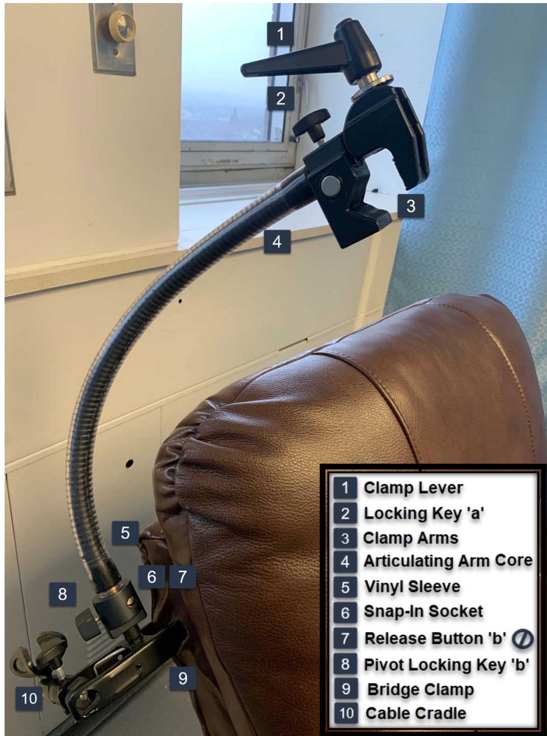
Figure 2: Anchored Articulating Arm (AAA) schematic - AAAs are made out of inexpensive camera tripod equipment and are anchored at their base to the corner of the treatment chair. Coils are held securely by a clamp locking it to the AAA, maintaining position until treatment has been completed, at which time they can be quickly twisted out of the way.