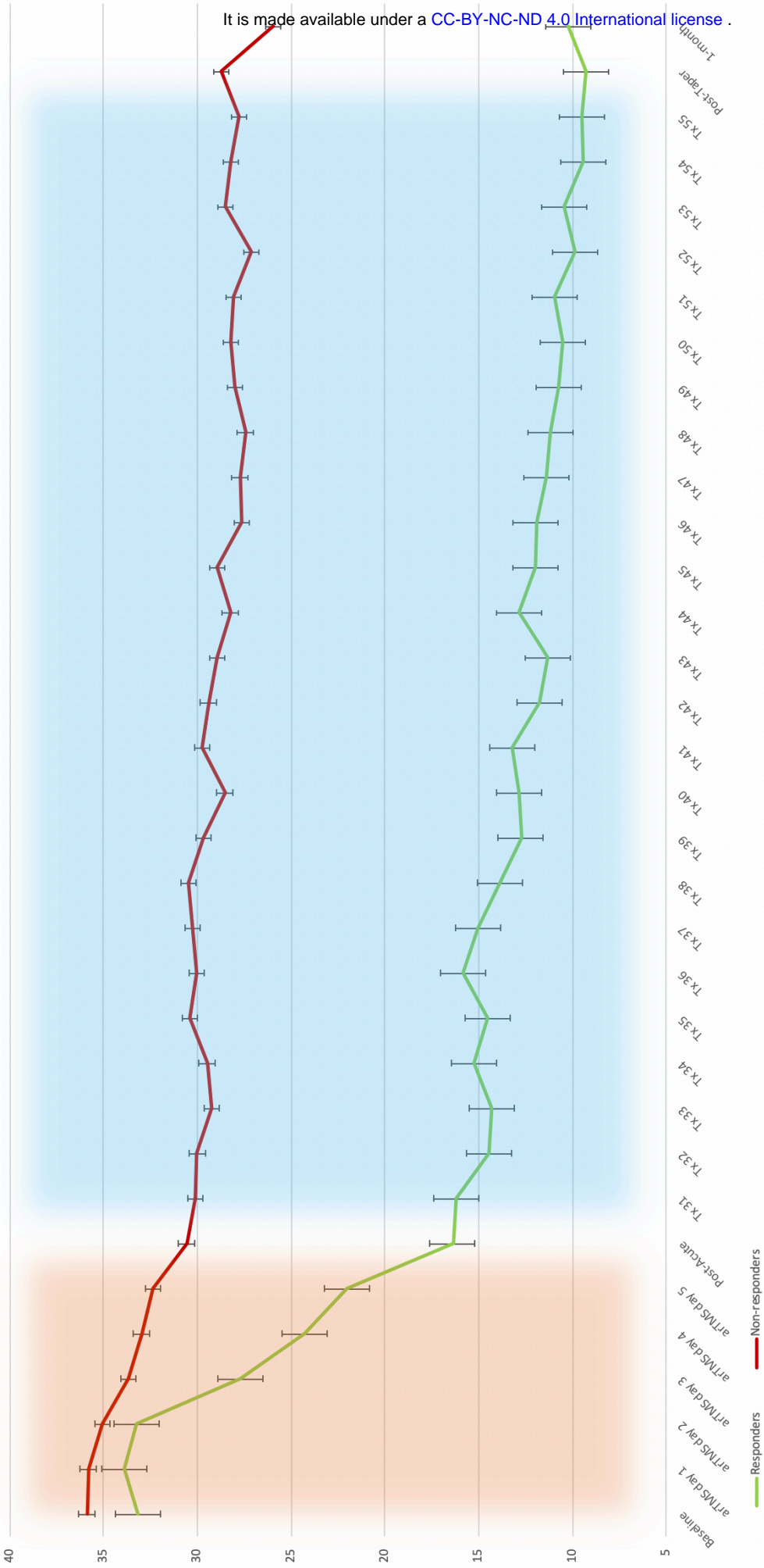
Fig. 5. Trajectories of improvement on the BDI-II. Responders showed rapid improvement during the accelerated course, having achieved response on average response post-acutely, and continued to show slow but steady additional improvement up to the end of the tapering course. Use of background shading delineates arTMS from tapering course. BDI-II = the Beck Depression Inventory – II, arTMS = accelerated repetitive transcranial magnetic stimulation, Tx = treatment (rTMS session)

It is made available under a CC-BY-NC-ND 4.0 International license .