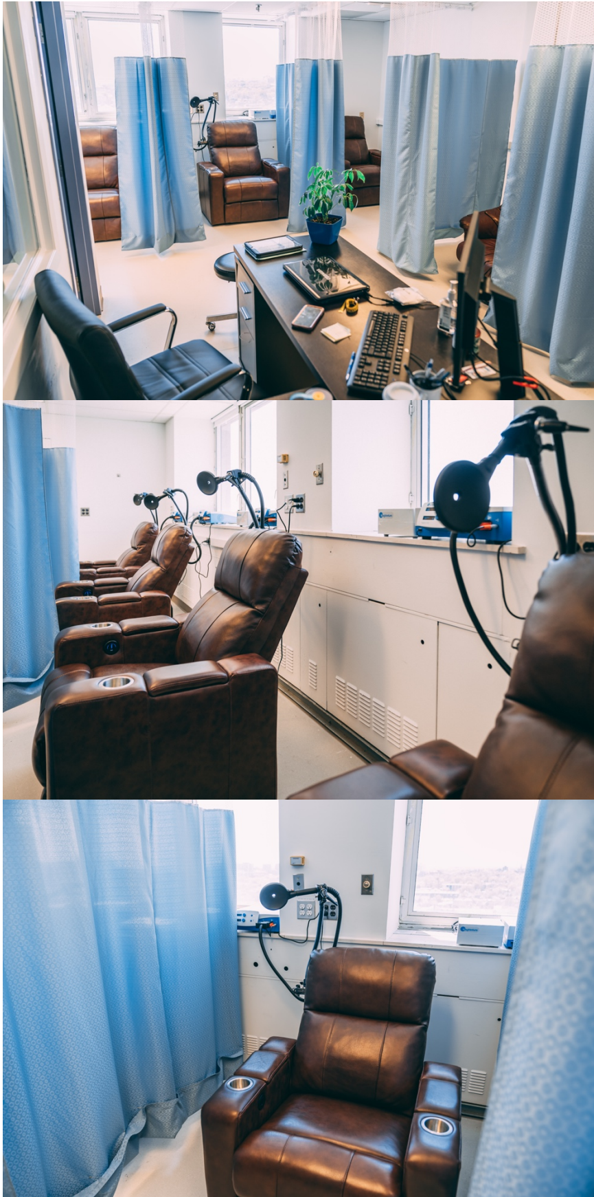
Figure 1: Clinical setup - 4 recliners equipped with AAAs holding rTMS coils, connected to the rTMS stimulators. Treatment was delivered in an open room setting, allowing up to 4 participants to receive treatment simultaneously, with the help of one or two technicians. AAA = Anchored Articulating Arm

It is made available under a CC-BY-NC-ND 4.0 International license .