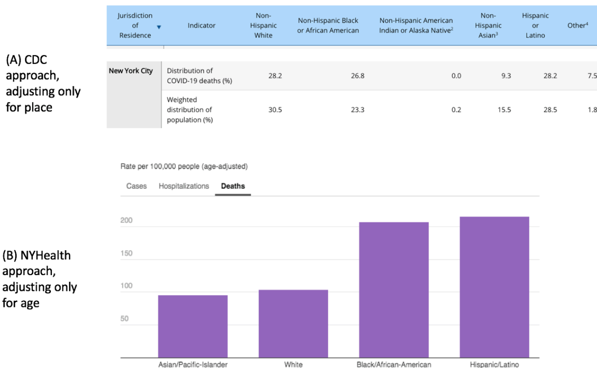
Figure 1. Conflicting indicators of COVID-19 mortality by race/ethnicity in New York City. Mortality adjusted for geographic distribution is represented by panel A, taken from the CDC webpage for provisional COVID-19 death counts by race/ethnicity on May 18, 2020 [1]. Mortality adjusted for age distribution is represented by panel B, taken from the New York City DOHMH COVID-19 webpage [2].

Place adjustment and age adjustment tend to work in opposite directions and either approach in isolation is potentially misleading. This divergence in results can be seen in Fig. 1 for New York City, the primary center of COVID-19 infection in the United States. Geographic