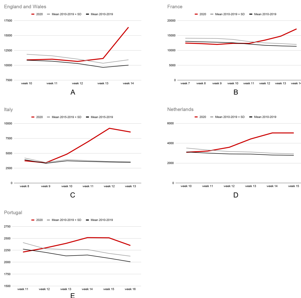
Figure 1: All-cause mortality data for selected countries, mean and 2020

ally, lower mortality rates during January and February, mostly due to a warm winter season in Europe and a light influenza season, may help explain some of this excess mortality, in an effect commonly called harvesting.