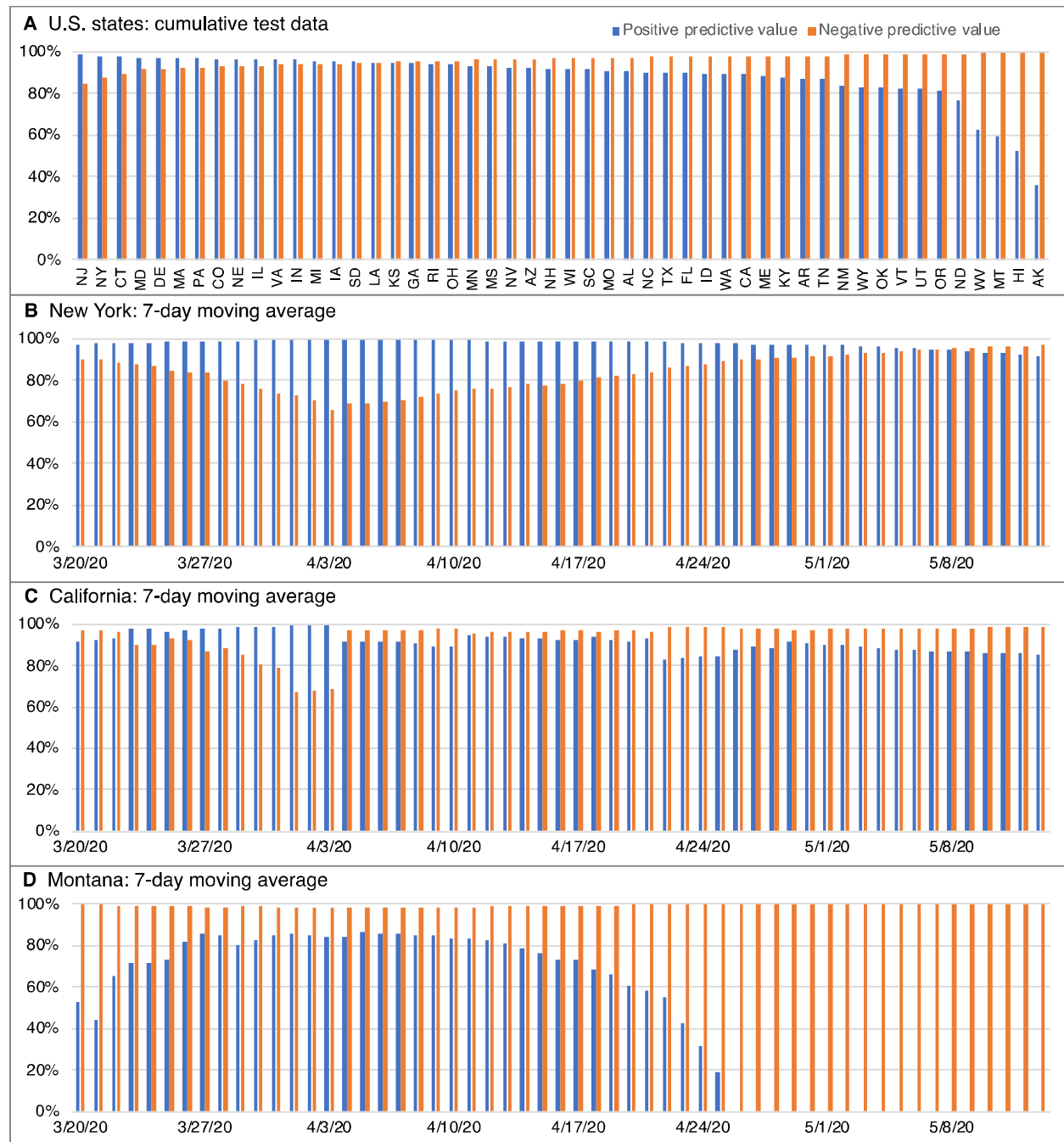
Figure 1. Reliability of SARS-CoV-2 test results in the United States. Positive predictive value (the probability that a positive result is true) and negative predictive value (the probability that a negative result is true) calculated with a false negative rate of 25% and a false positive rate of 0.8%. (A) Results for the 50 U.S. states based on cumulative test data through May 13, 2020. States arranged left to right in order of decreasing test positivity. (B-D) Reliability trajectories based on the previous-7-day moving average for states with positive test results with high reliability (New York), reliability starting to decline (California), and steeply declined reliability (Montana). Test data are from The COVID Tracking Project ( https://covidtracking.com/about-data accessed May 14, 2020).