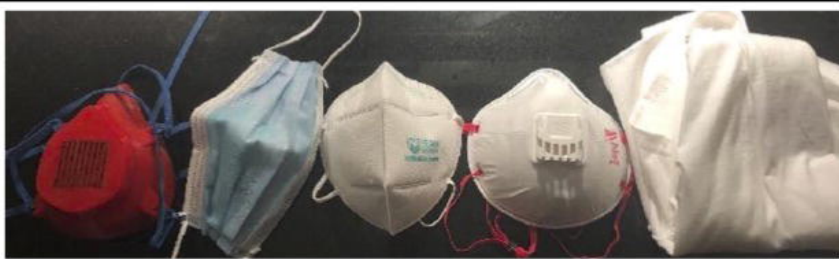
Figure 1: In order from left to right: 3D Printed Reusable N95 Respirator, surgical mask, KN95, N95, cotton cloth.