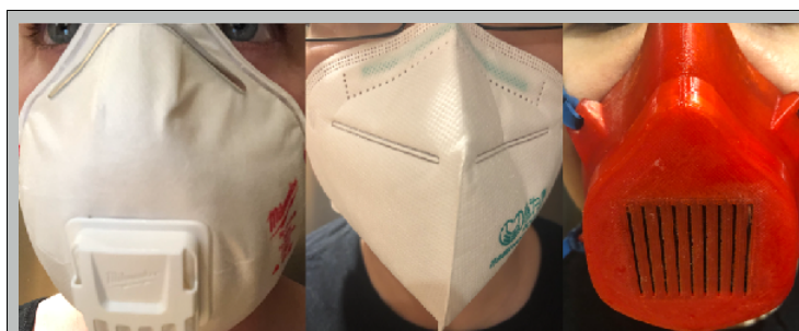
Figure 2: From left to right: Milwaukee N95 Respirator, Powecom KN95, 3D Printed Reusable Respirator. Perforations are visible at the top of middle mask (KN95).

All three of the N95 or comparable respirators were first visually examined and determined to have no leaks. The 3D printed reusable N95 respirator had the tightest seal, where as the Powecom KN95 appeared to have the least tight seal. Visual inspection of the KN95 revealed perforation along the nose, although this did not seem to ultimately impact the filtration capabilities.