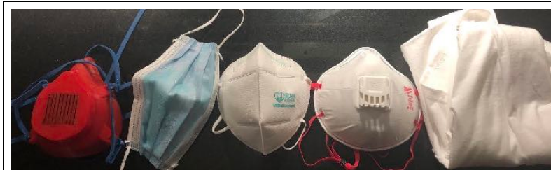
Figure 1: In order from left to right: 3D Printed Reusable N95 Respirator, surgical mask, KN95, N95, cotton cloth.

The 3D Printed Reusable N95 Respirator, KN95, and Milwaukee N95 were all considered N95 or comparable and were first tested for fit and suction prior to test. Subjects placed mask and then performed a qualitative check for any leaks around the surface. The 3D printed Reusable N95 Respirator and Milwaukee N95 respirator had previously passed a qualitative Bitrix fit test at GWUH employee health and functioned as a positive control for the experiment.