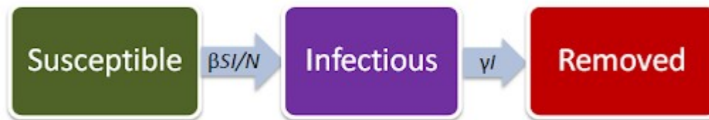
456 Figure 2 Flow rates in SIR Model.