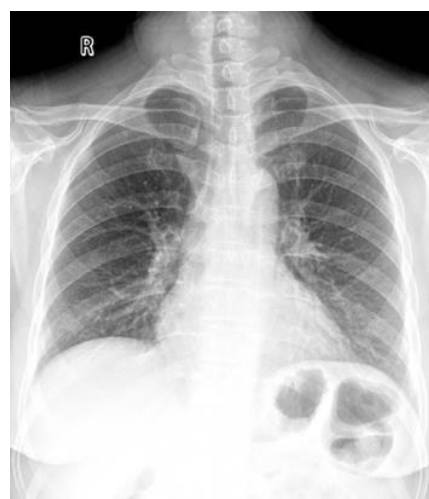
Figure 3. Chest Radiographs image of the patient on Feb 28. After treatment, lesion in the lungs were reduced. Hardly GGO samples were seen.