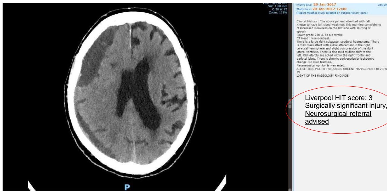
Figure 3- example case using the Liverpool HIT score (HITS) in a patient presenting to the emergency department with left sided weakness and a GCS of 14