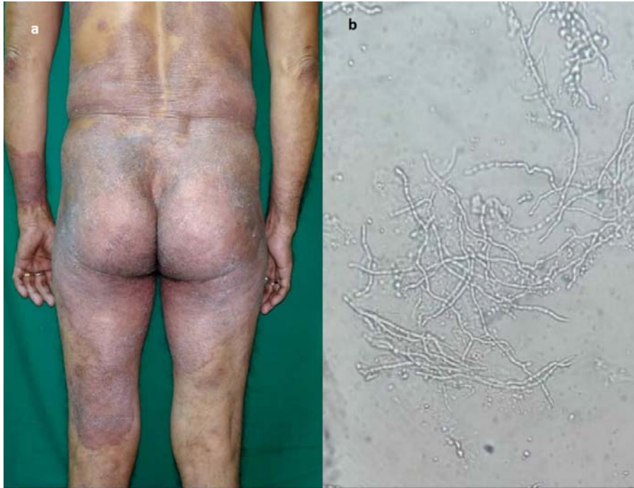
Figure 1. (a) A 55-year-old man with extensive tinea corporis, body surface area affected is 35%; (b) 20% potassium hydroxide microscopic (KOH) examination of skin scrapings showing septate, branching hyphae.